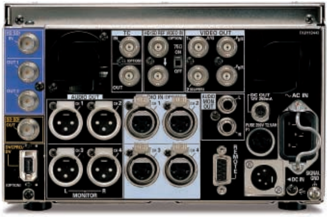
Rear Panel with AJ-YA120AG & AJ-YAD120AG