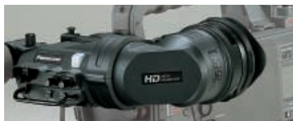
AJ-HVF21G 2" HD EVF 59.94Hz/50.00Hz switchable