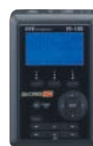
FireStore FS-100 Portable DTE Recorder (FOCUS Enhancements, Inc.)