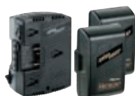
Anton/Bauer Battery Charger Package HTP-T230