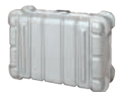
AJ-HT901G Hard Carrying Case *Not available in some areas.