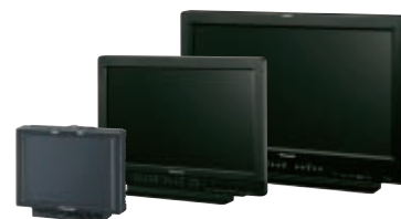
BT-LH900A 8.4" HD/SD LCD monitor BT-LH1700W 17" Wide HD/SD LCD monitor BT-LH2600W 26" Wide HD/SD LCD monitor