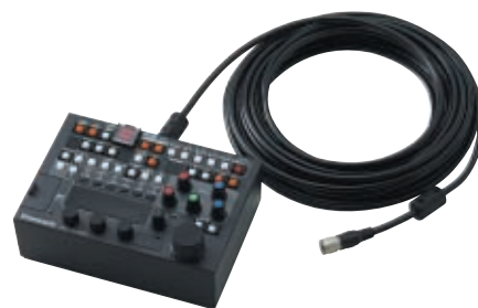
AJ-RC10G RCU (Remote Control Unit) • 10P Remote Cable 10m